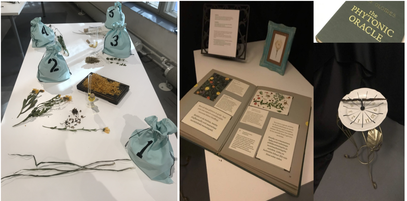
(left: Flower Clock, variation II. right: Phytonic Oracle Installation.)